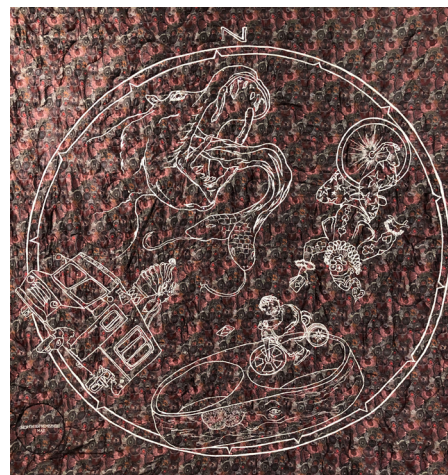
Kambui Olujimi, Wayward North (detail), 2010. Fabric, rhinestones, and embroidery.