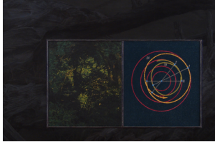
Phillip Chen: No Ideas but in Things 6/5 - 8/13

Phillip Chen, Moments of Being , 1992. Oil on three panels. 27 x 30.75 inches.