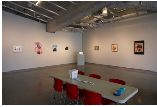
Emergence (Curated by Teen Art Group) 6/1 - 7/16 Installation view of Emergence (Curated by Teen Art Group) .