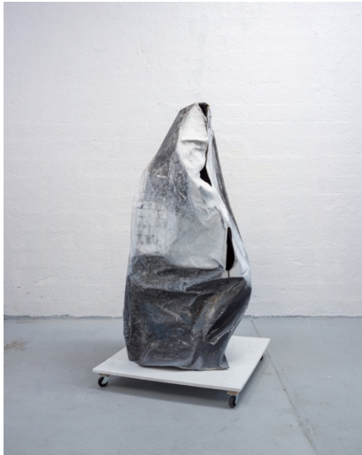
Nazafarin Lotfi, Learning to Hold , 2019. Papier-mâché and paint. 17 x 42 x 20 inches.

Kantara: Your sculpture Learning to Hold (2019) continues this representing a body without physically creating a body. When you consider the pressure to represent a particular body (woman, Muslim, Iranian, African, etc.), the choice not to represent a body is really about not capitalizing on it for the sake of other people's expectations. It is a similar story we hear from people of color artists and artists from colonial territories and legacies who work in predominately white spaces. These are artists who are persistently asked: Where is the African in your work? Where is the Muslim in your work? Where is the Iranian in your work?