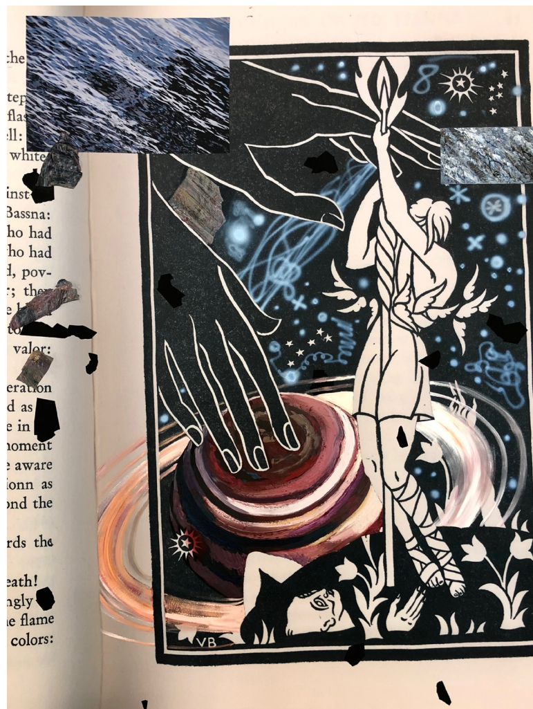
Breath! (Illustrated by Vera Bock), 2019. Acrylic on dyed canvas.

g UNIVERSITY GALLERIES of Illinois State University 11 Uptown Circle, Normal, IL 61761 309.438.5487 • galleries.ilstu.edu