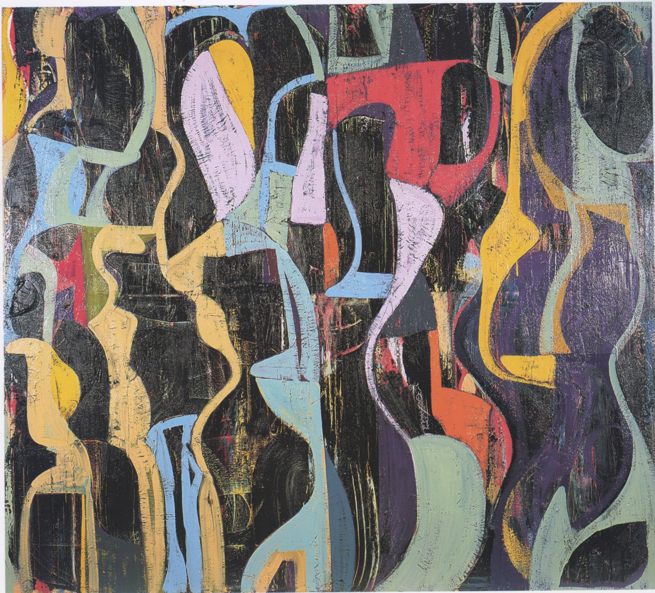
jason fascination black plum