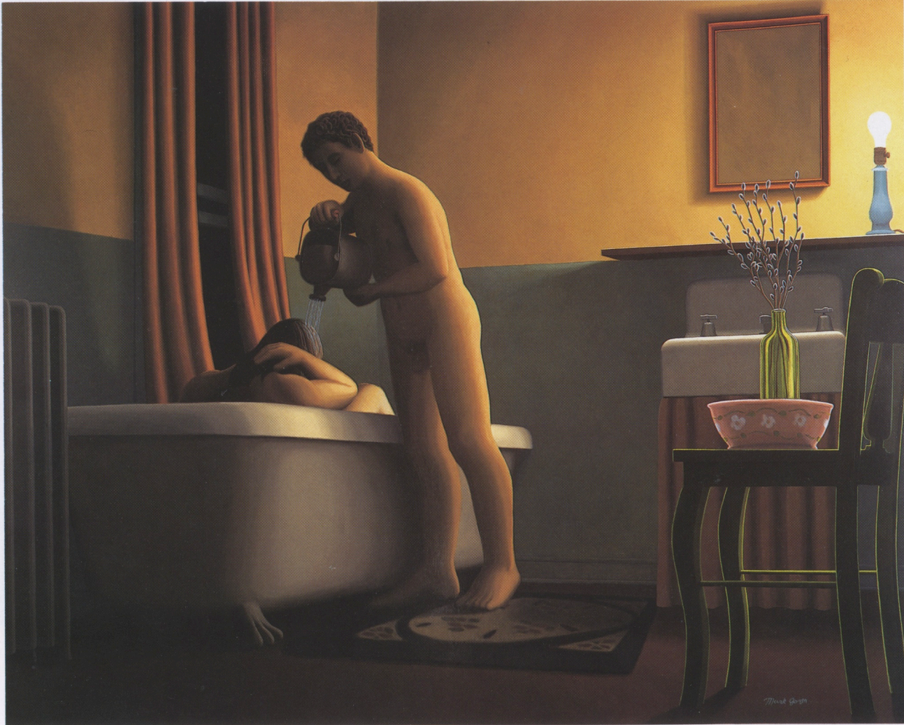
Spring II 1991