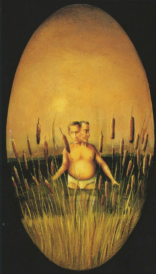
THE LAST SURVIVING PORTRAIT OF A DOUBLE MINDED MAN