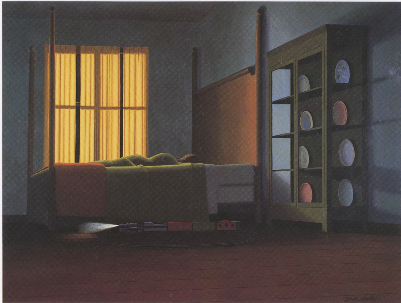
Night Train 1990