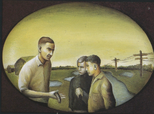
NO BOYS: THIS CAME OFF A COW 1990