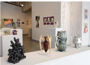
2017 Student Annual Installation view of the 2016 Student Annual.

5/20 FRIENDS OF THE ARTS' GALA AT THE GALLERY *Ticket purchase required Saturday, from 5 to 7 pm