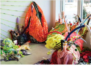
2017 MFA Biennial Installation view of Stoney Sasser's Habit(at): Garden Variety in the 2015 MFA Biennial.