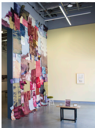
2019 Student Annual