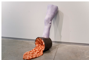
2019 MFA Biennial

Josh Roach. Leg (Scoop) , 2016. Blanket, papier-mâché, drywall compound, plaster, and paint. Installation view of 2017 MFA Biennial.